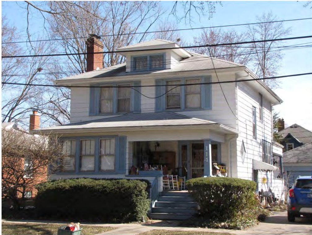
West 114_Looking Northeast