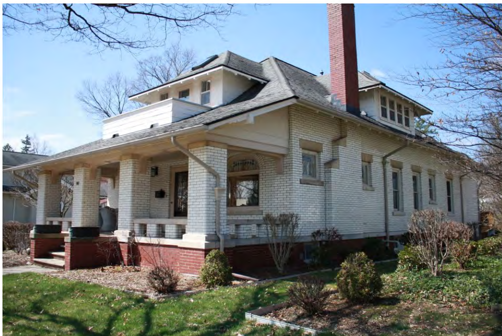
High 223_Looking Southwest