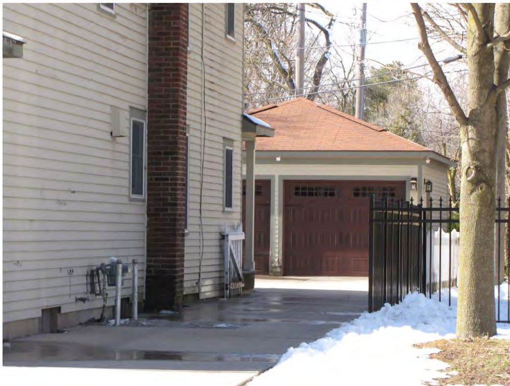
Linden 115, Garage_Looking West