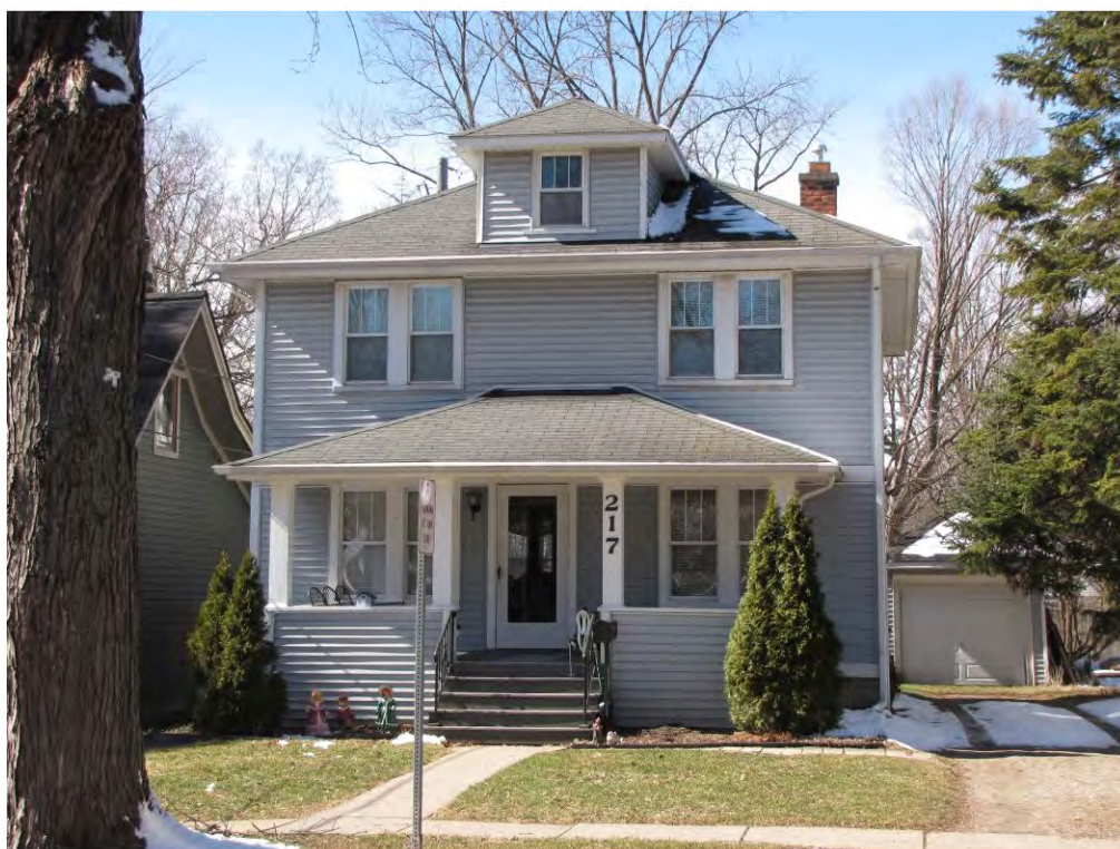
Linden 217, Garage_Looking West