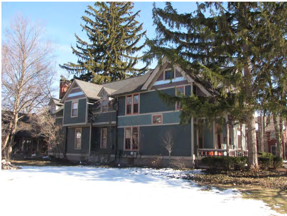
Dunlap West 504_Looking Northeast