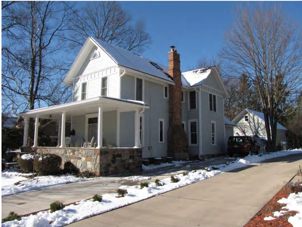
Rogers South 128_Looking Southwest