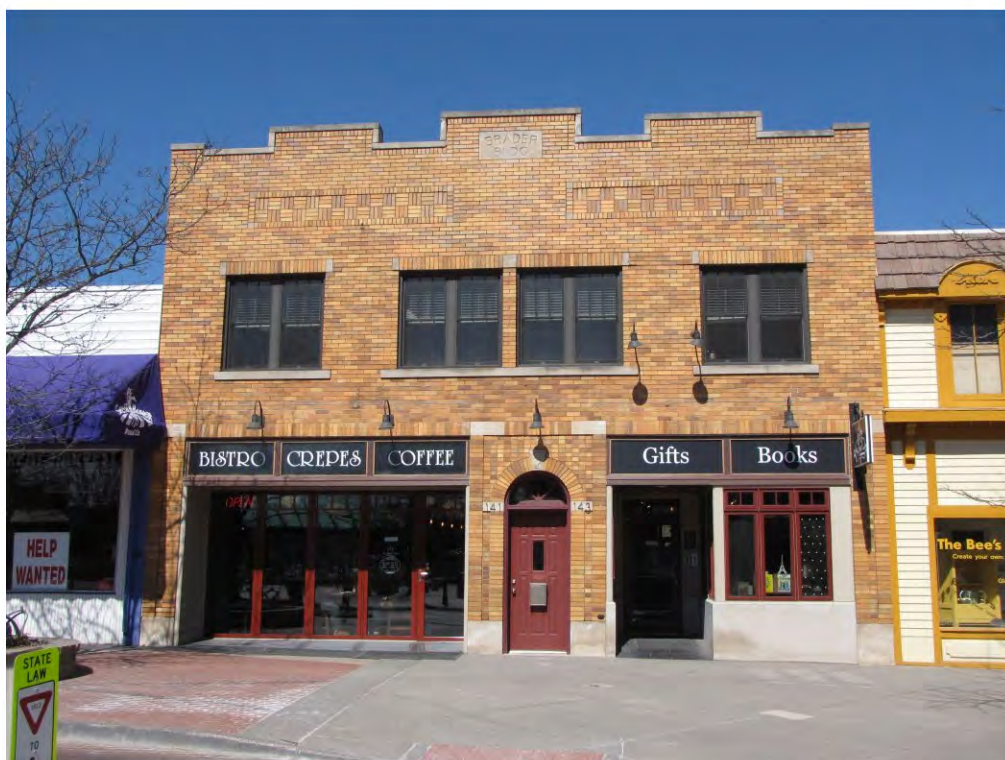
Main East 141-143_Looking North