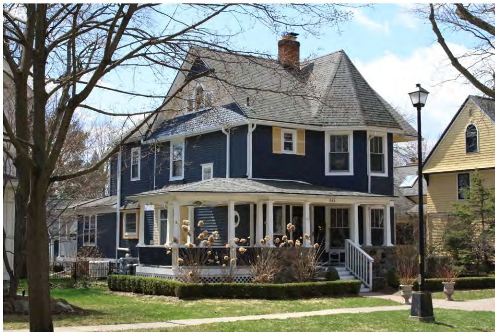
Dunlap West 543_Looking Southwest