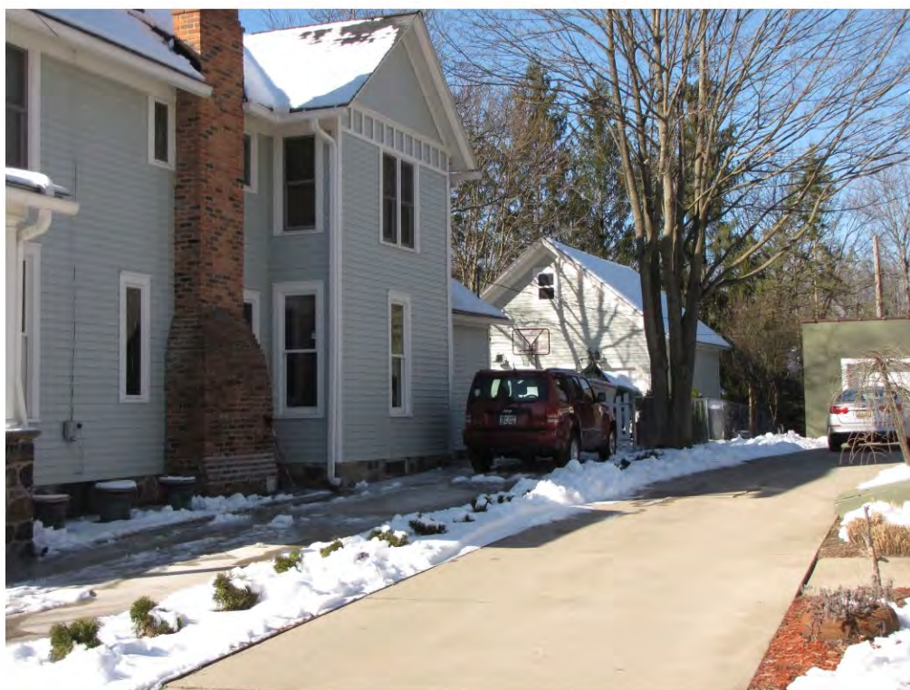
Rogers South 128, Garage_Looking West