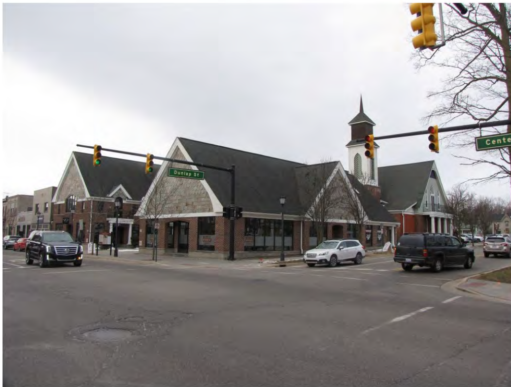
Center North 145_Looking Southwest