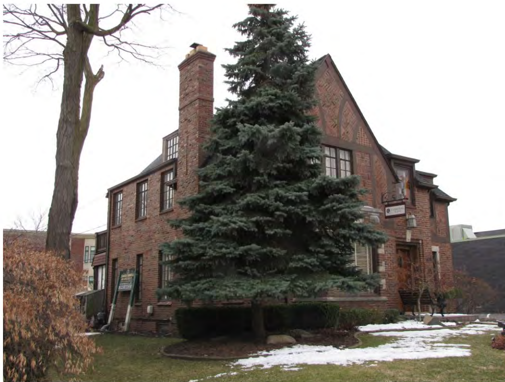
Main East 324_ Looking Southwest