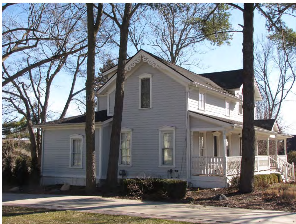
Randolph 116_Looking Northeast