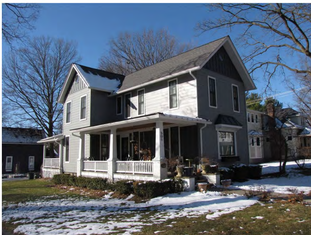
Cady West 501_Looking Southwest