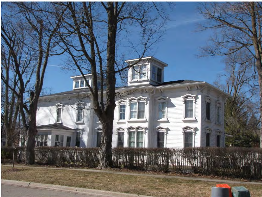
Dunlap West 404_Looking Southwest