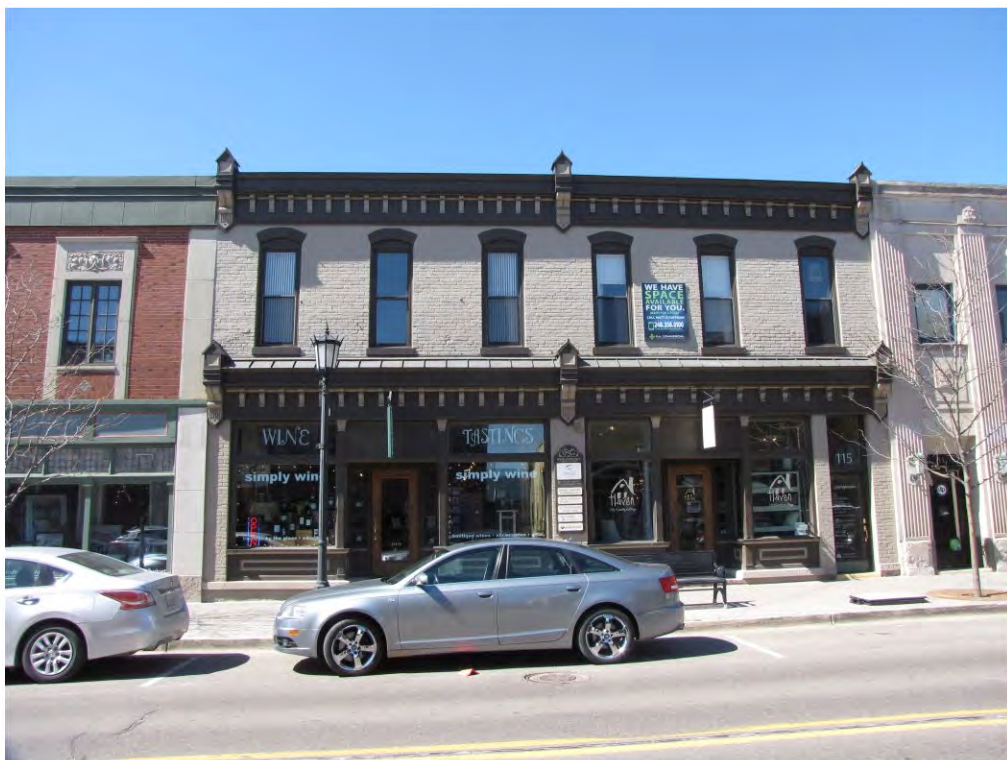
Center North 109-115_Looking West