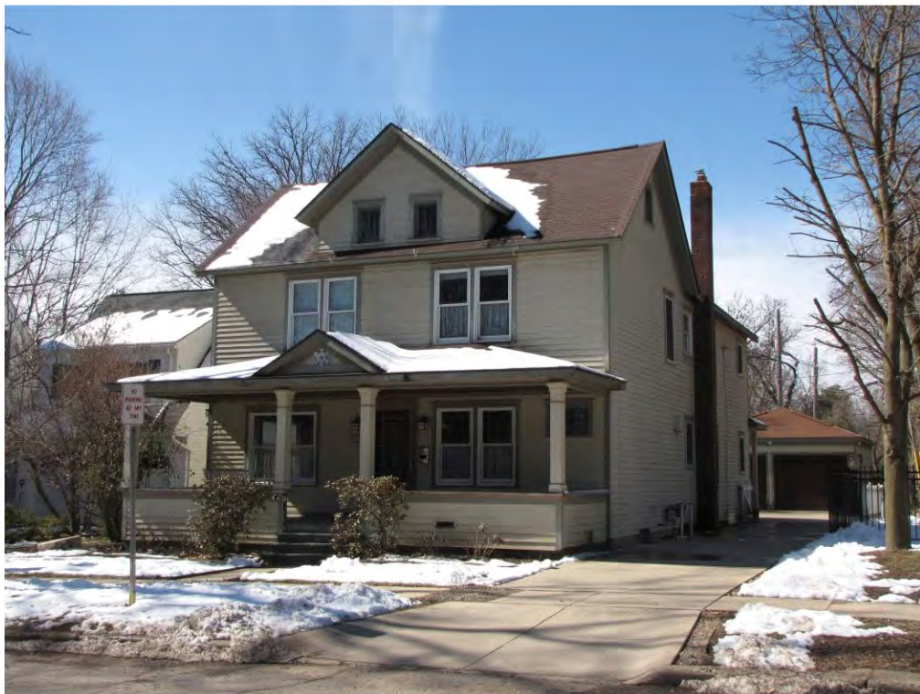
Linden 115_Looking Southwest