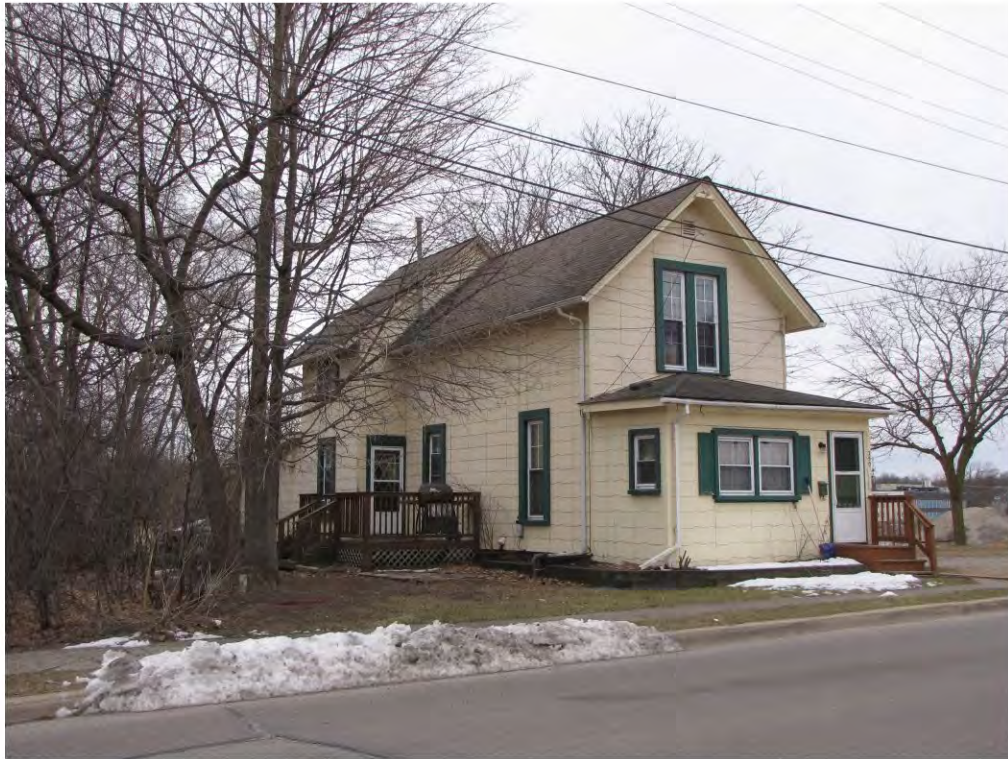
Cady East 350_Looking Southwest