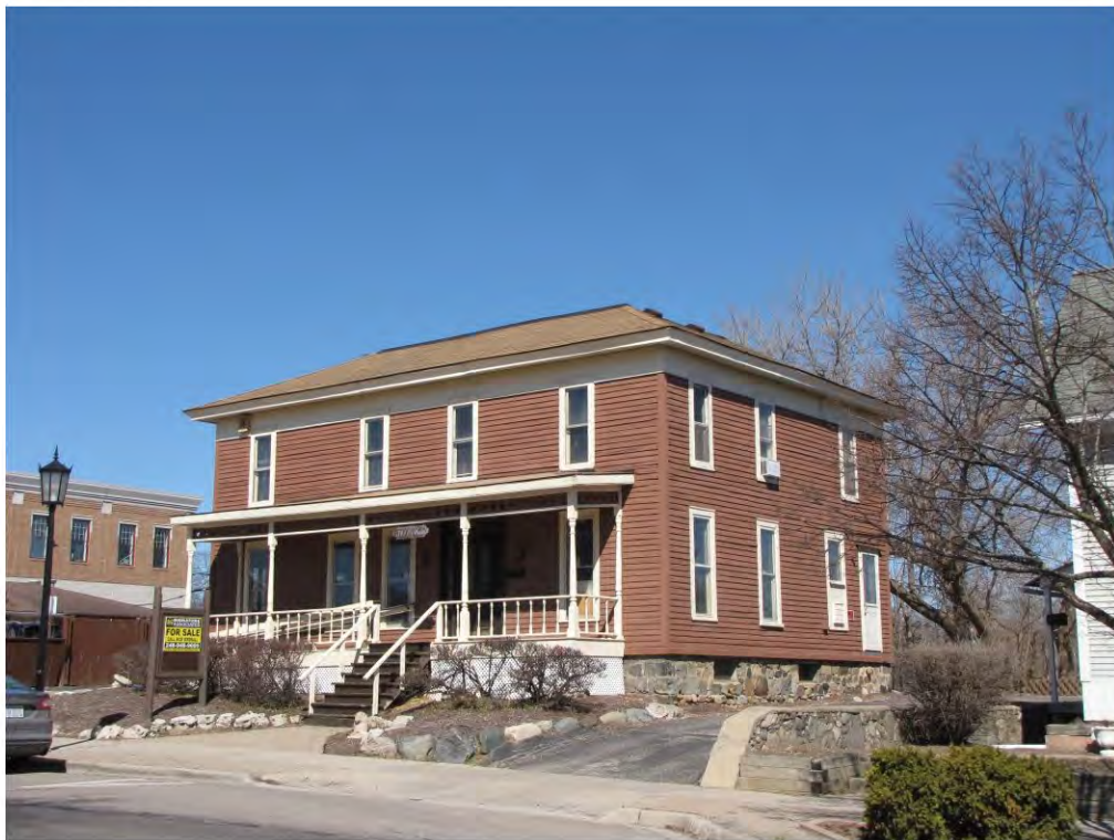
Main East 341_Looking Northwest