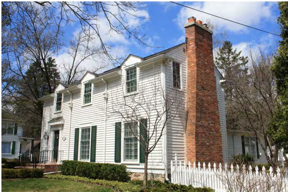
Main West 548_Looking Northwest