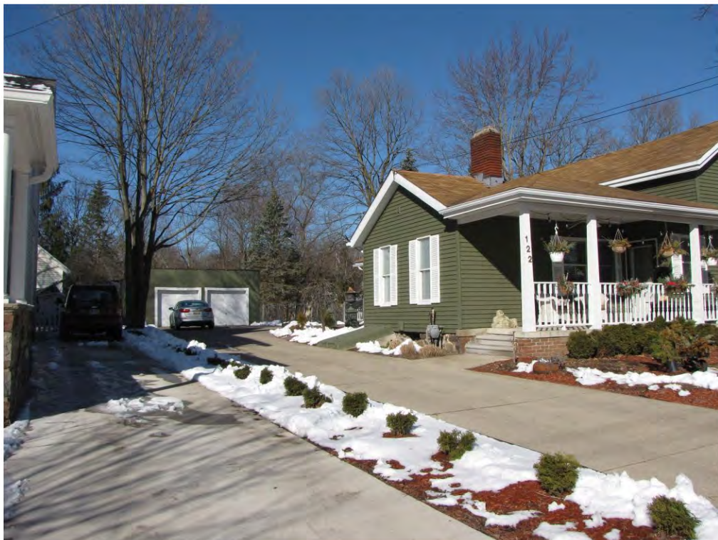
Rogers South 122, Garage_Looking West