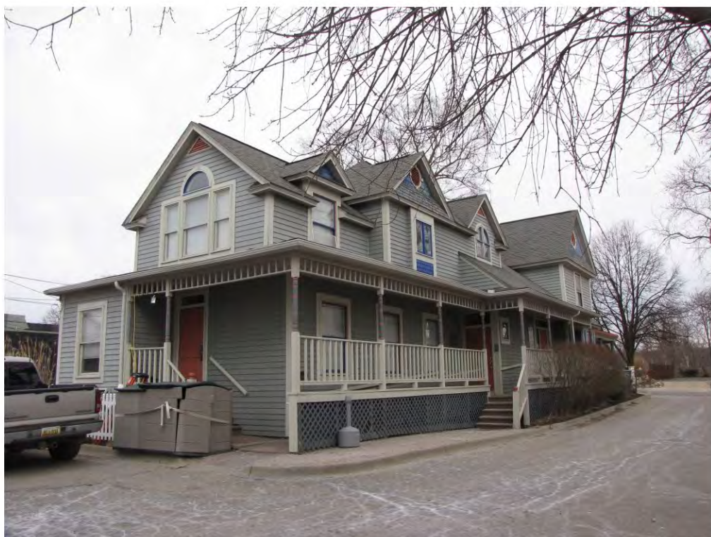
Main East 332_ Looking Northwest