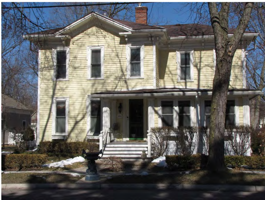
Main West 502_Looking North