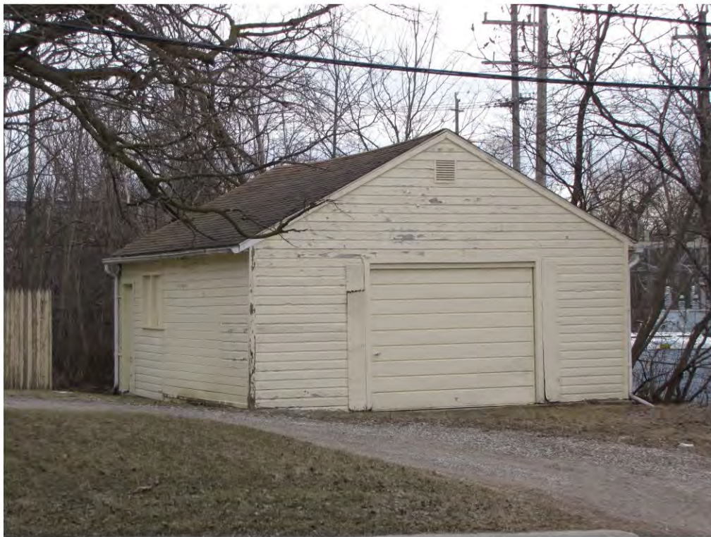
Cady East 350, Garage_Looking Southeast