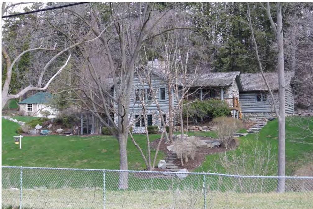
Randolph 528_ Looking North