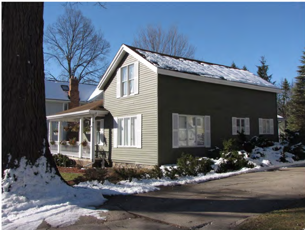
Rogers South 122_Looking Southwest