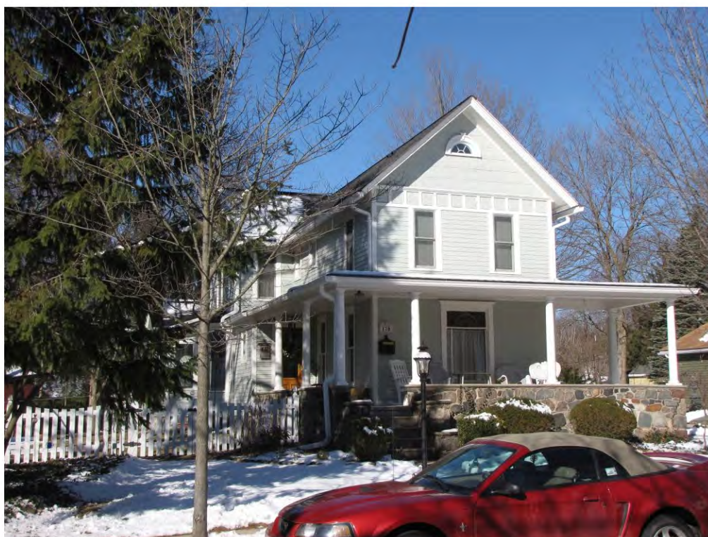
Rogers South 128_Looking Northwest