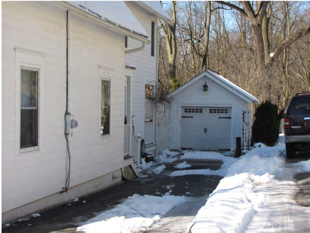
Rogers North 207, Garage_Looking West