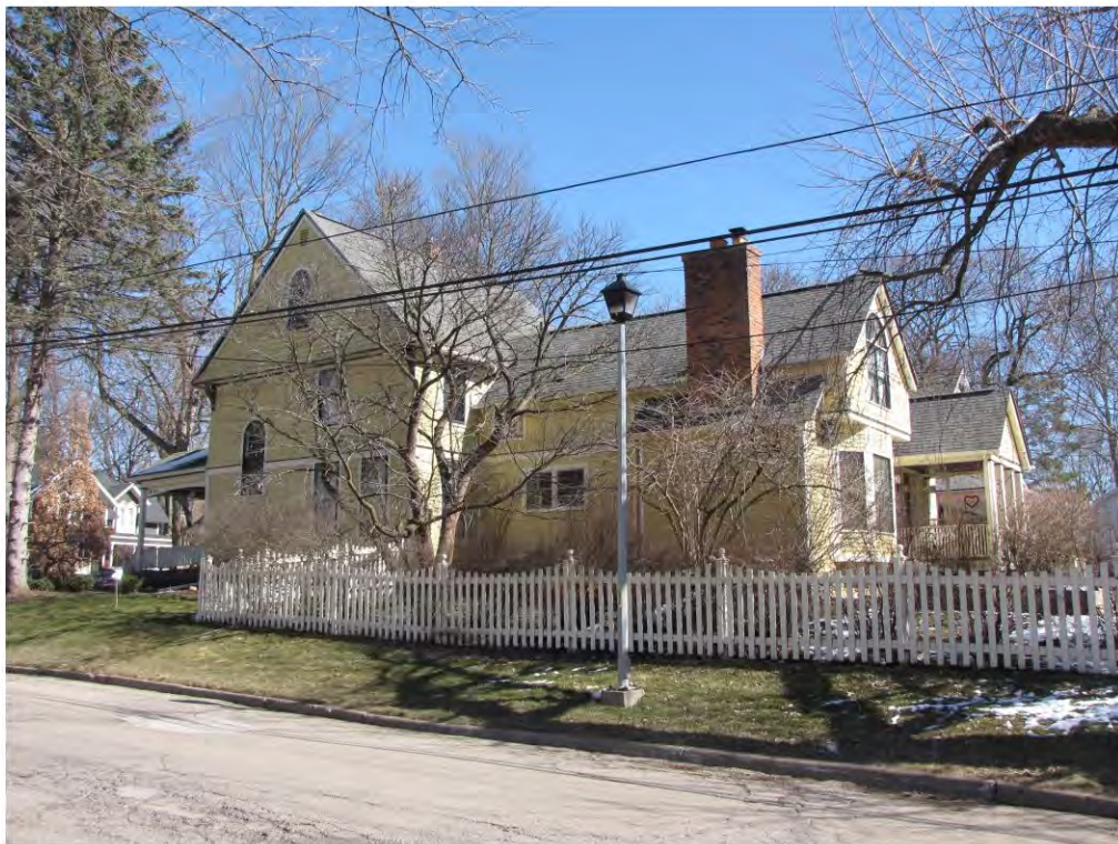
Dunlap West 549_Looking Northeast