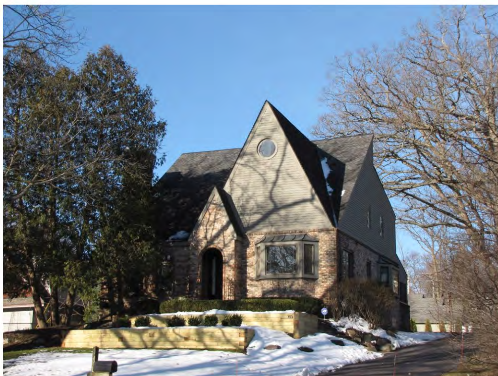
Linden 265_Looking Southwest