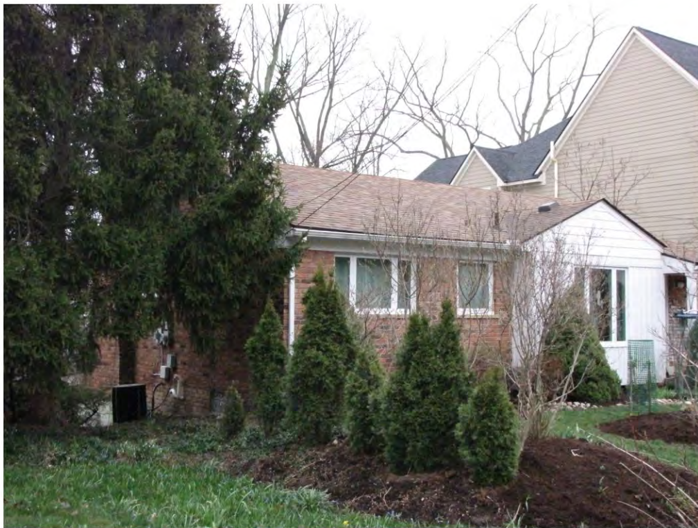
Rogers North 368_Looking Southeast