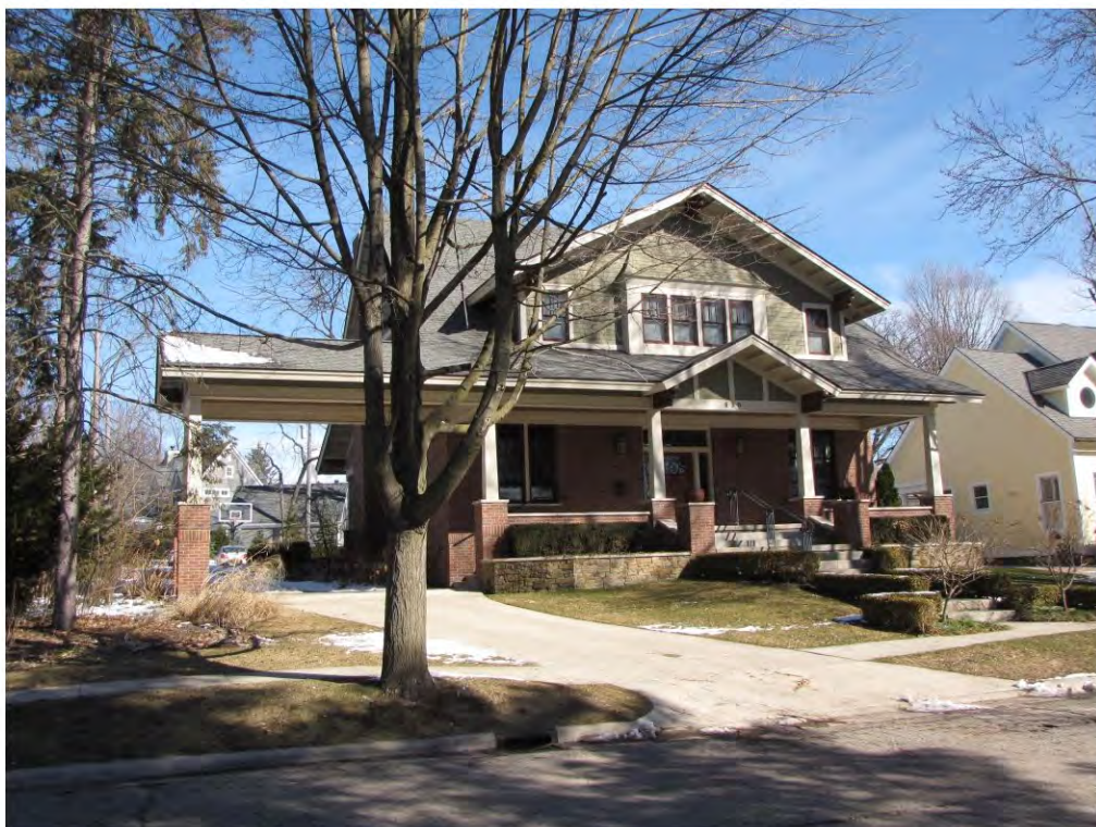
Dubuar 430_Looking Northeast