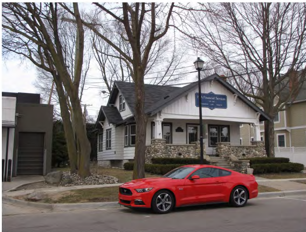
Wing North 111_Looking Northwest