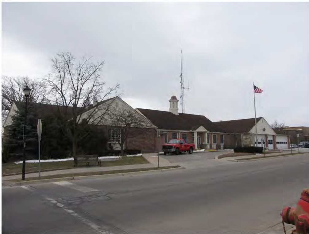
Main West 215_Looking Southwest