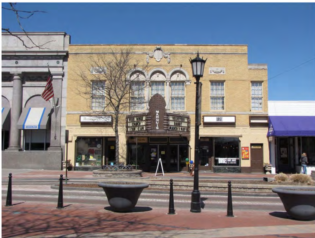
Main East 135-137_Looking North