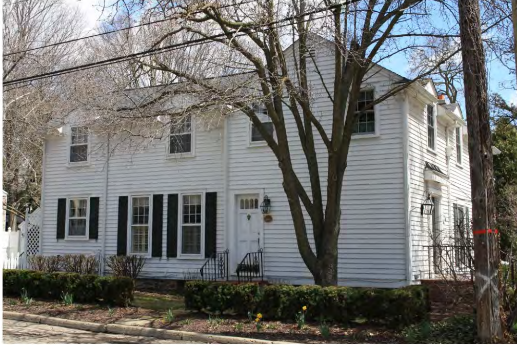
Main West 548_Looking East