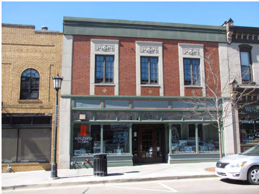
Center North 107_Looking West