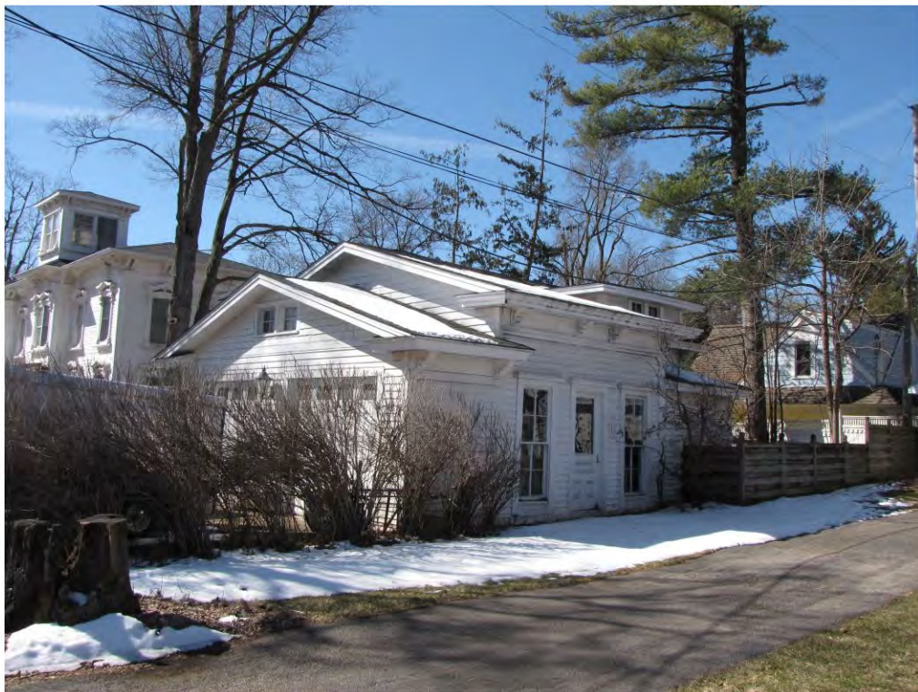
Dunlap West 404, Garage_Looking Southwest