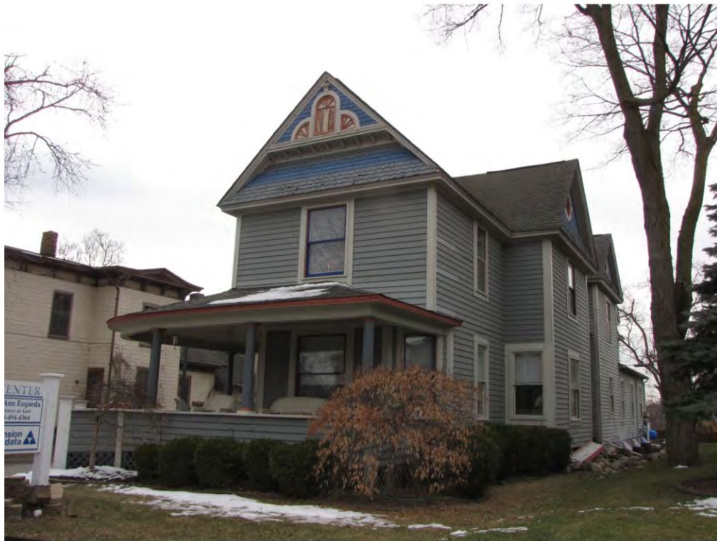
Main East 332_Looking Southeast