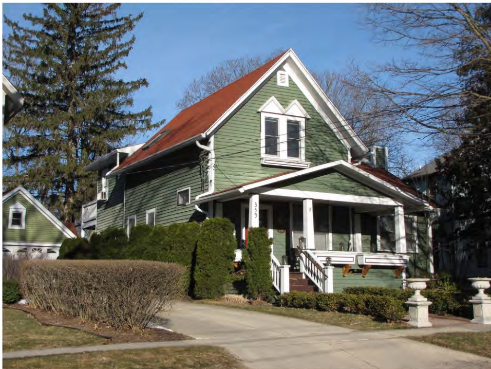
Rogers North 359_Looking Northwest