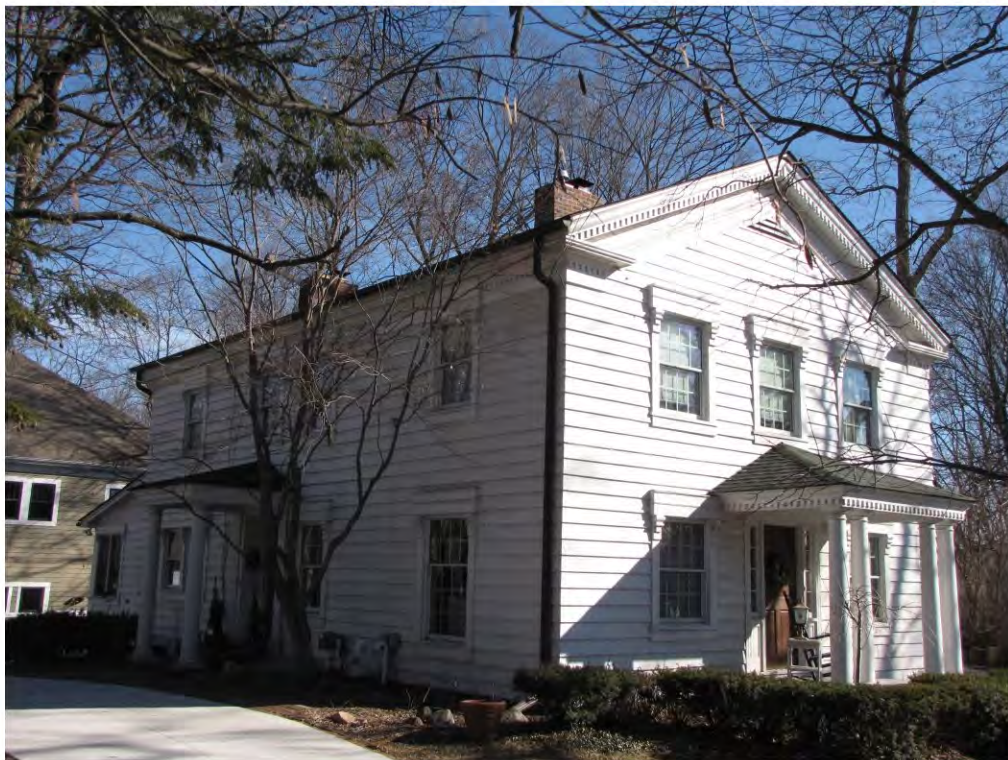
Randolph 204_Looking Northeast