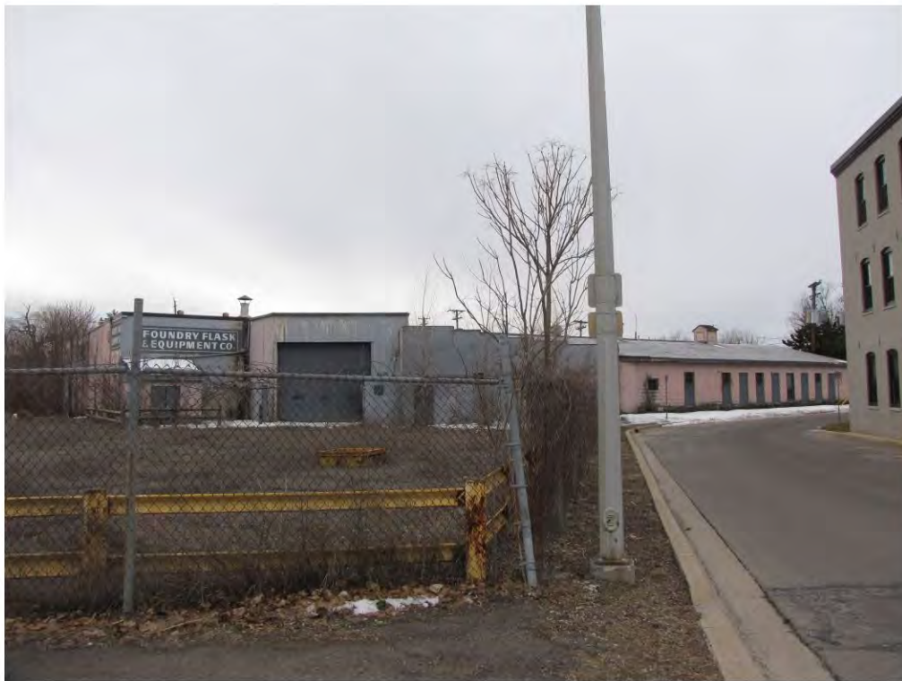
Cady East 456_Looking Southwest