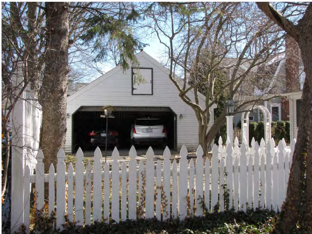
Main West 548, Garage_Looking East