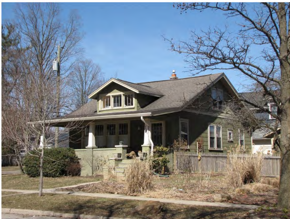
Dunlap West 314_Looking Northwest