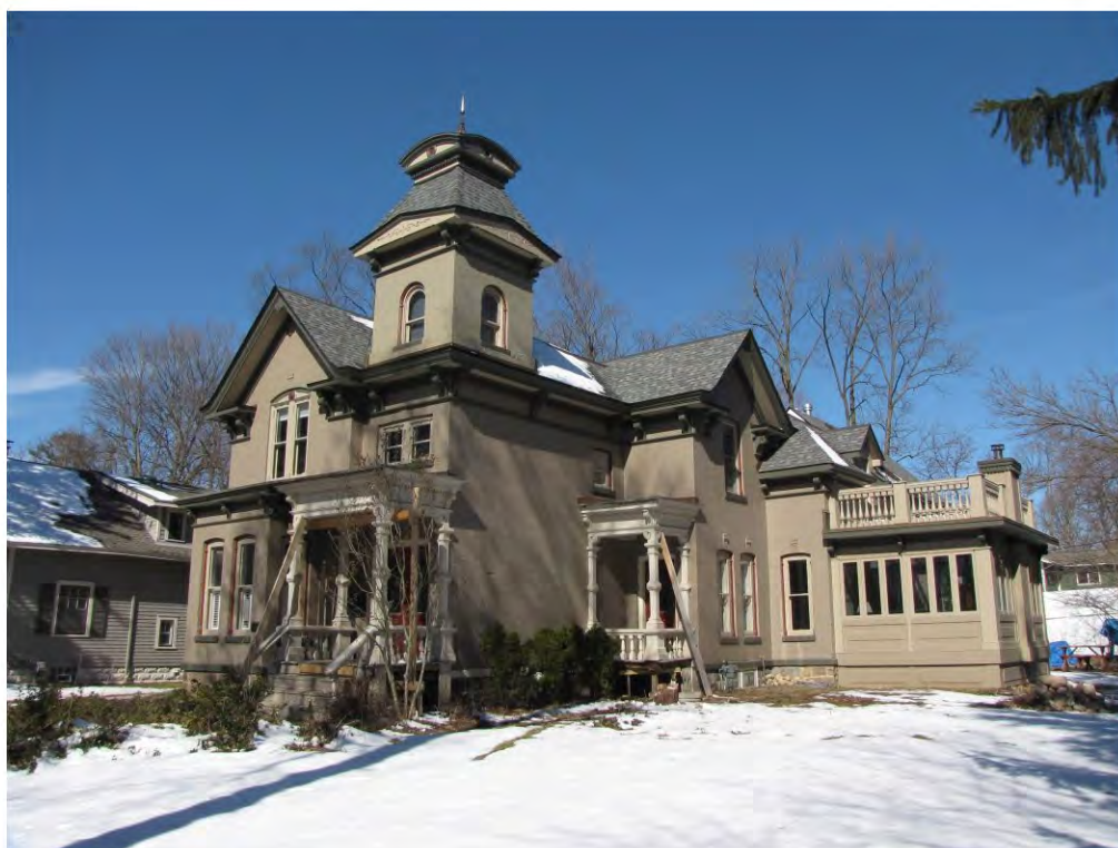
Dunlap West 512_Looking Northwest