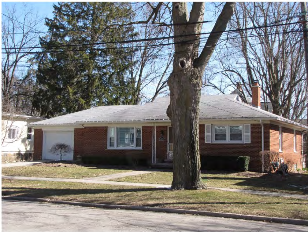
West 120_Looking Northeast