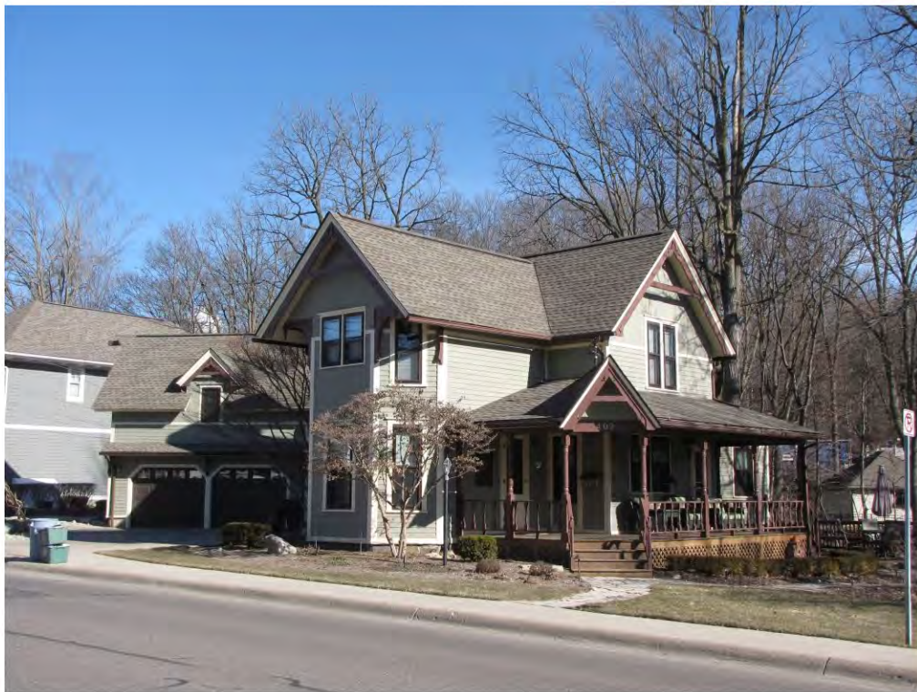
Randolph 402_ Looking Northwest