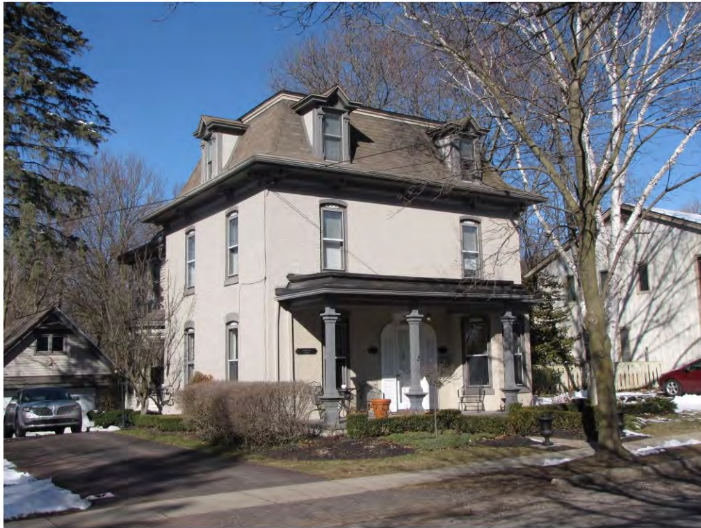
Rogers North 109_Looking Northwest