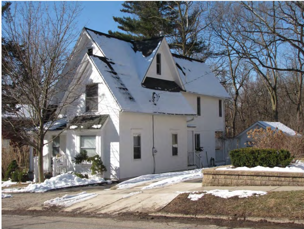
Rogers North 207_Looking Southwest