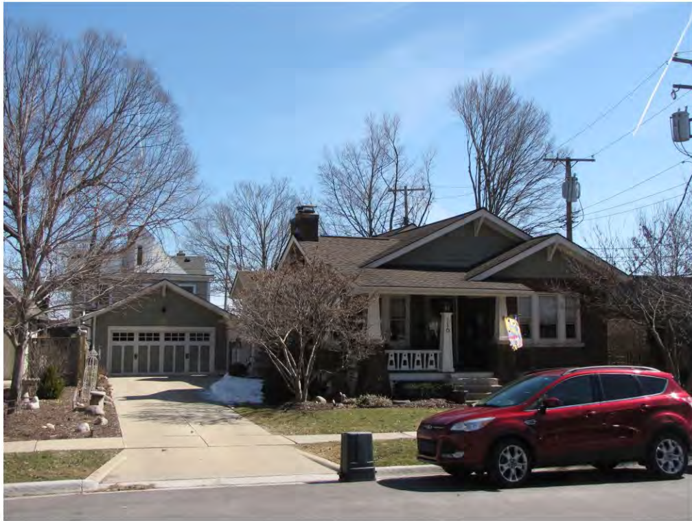
High 116_Looking Southeast