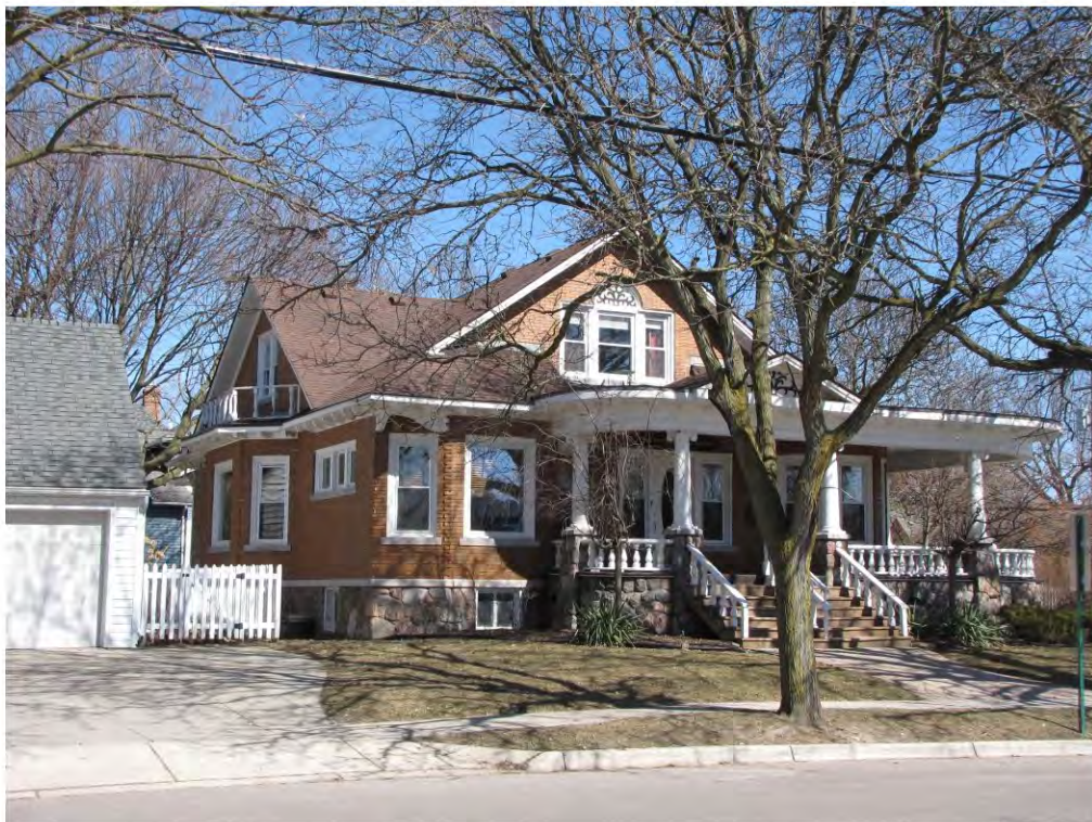
Main West 302_Looking Northeast