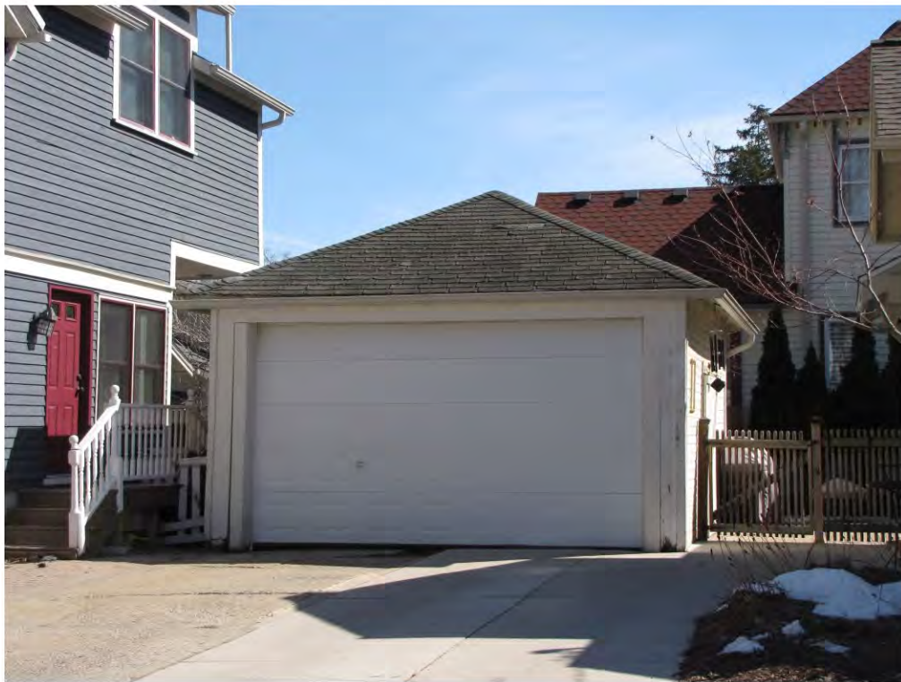
Dunlap West 314, Garage_Looking East