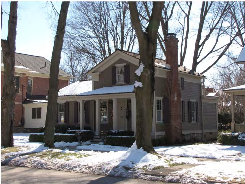
Dunlap West 511_Looking Southeast