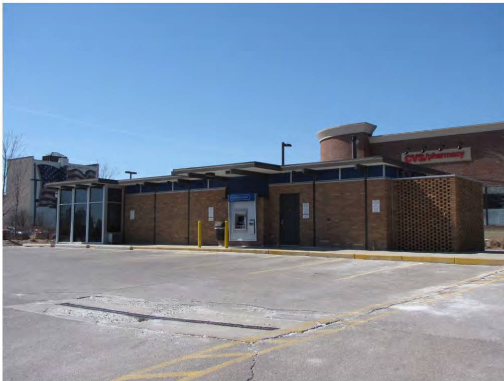
Dunlap East 143_Looking Southwest