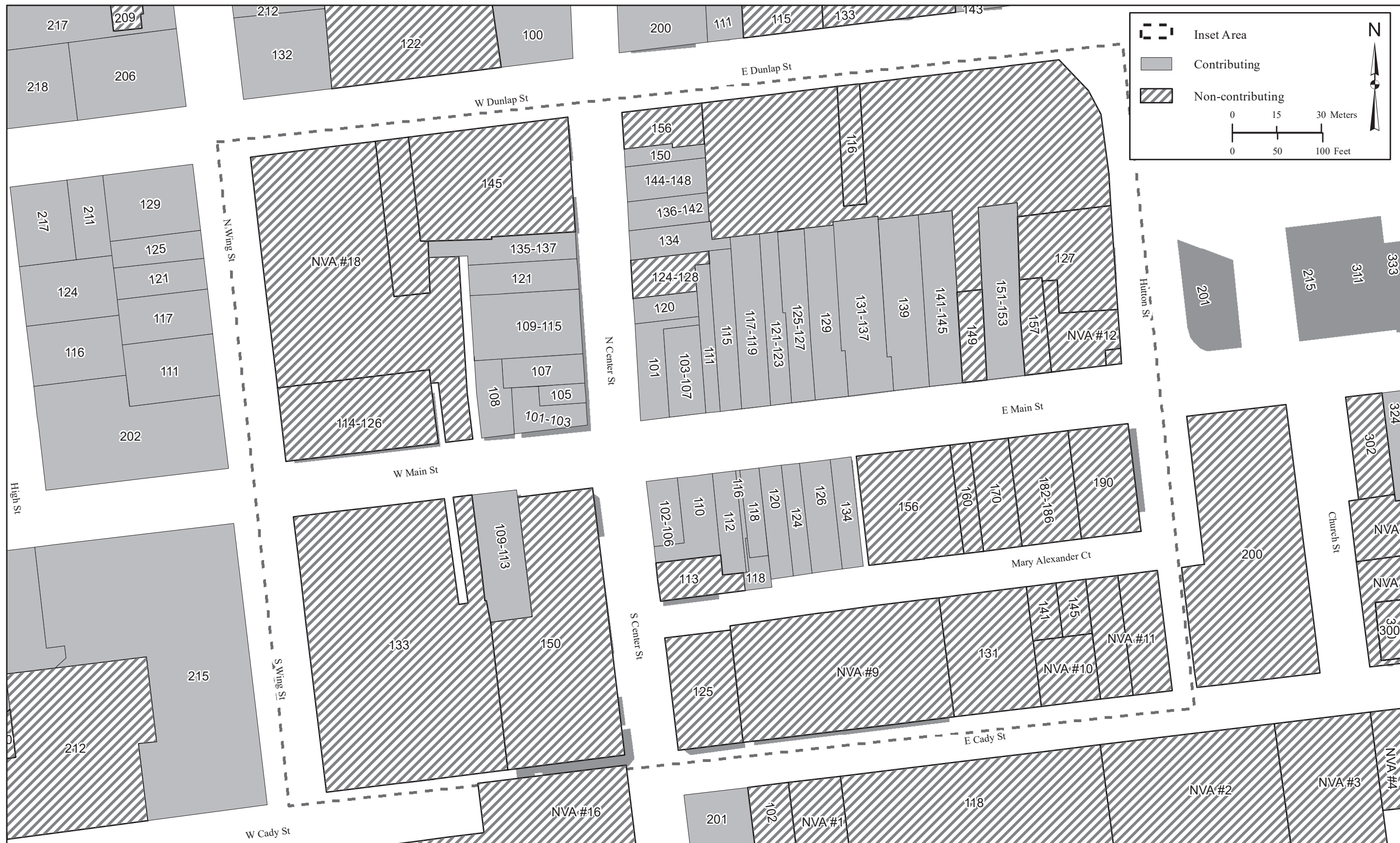
Figure 2-2. National Register Boundary: Northville Historic District, Northville, Wayne County, Michigan