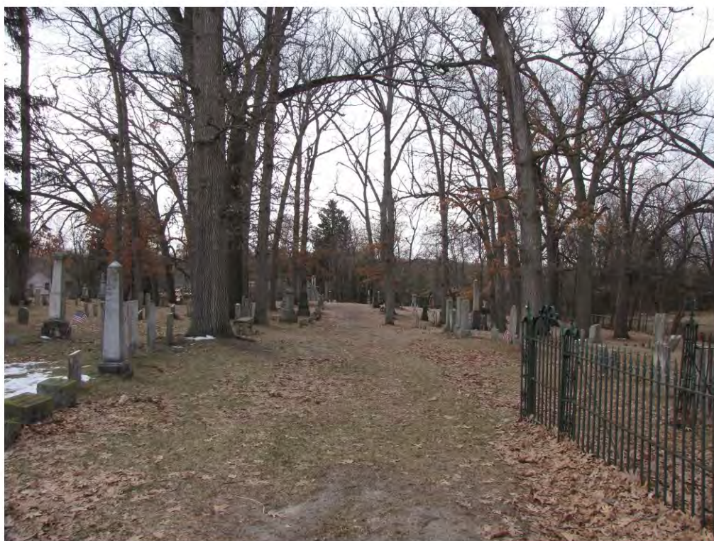
Cady West NVA 17_Looking South