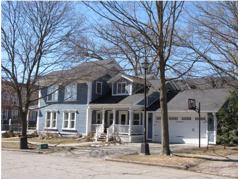
Main West 404_Looking Southwest