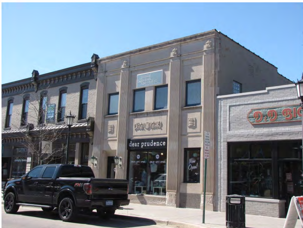
Center North 119_Looking Southwest