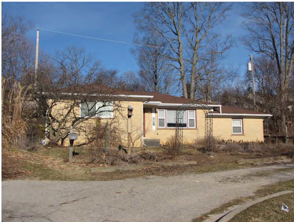
Linden Court 531_Looking Northwest