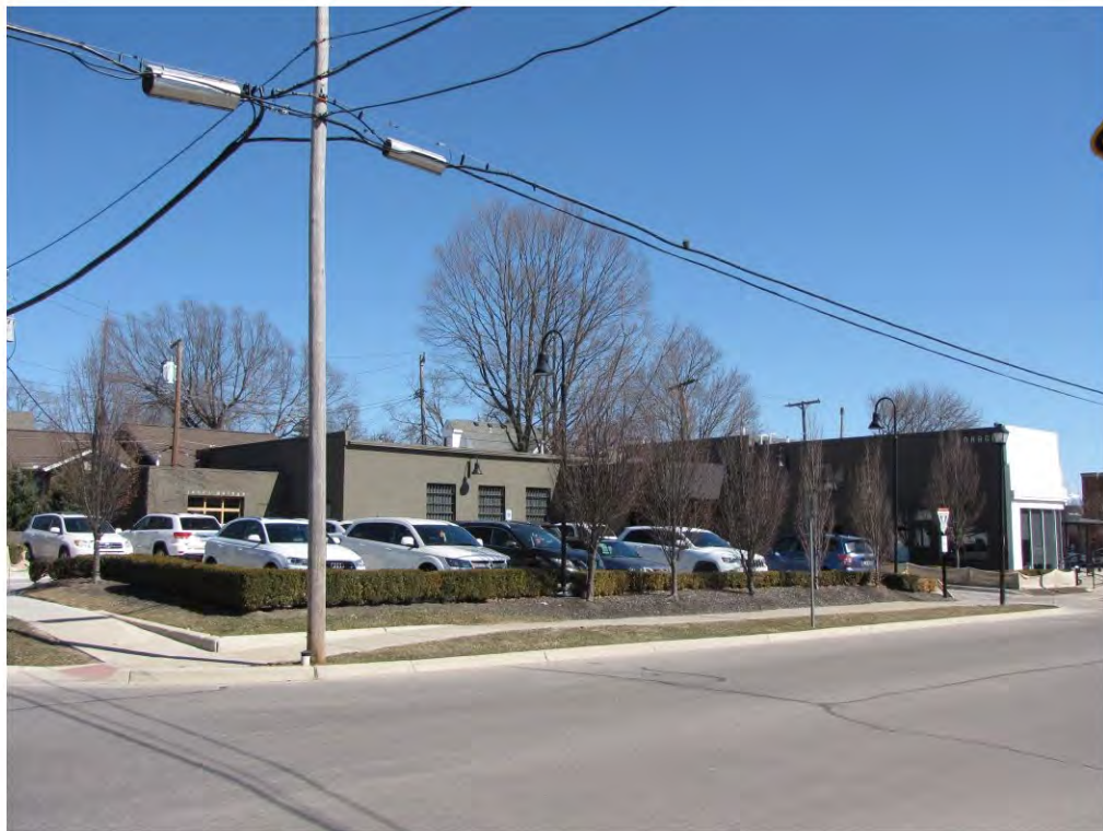
Main West 202_Looking Northeast