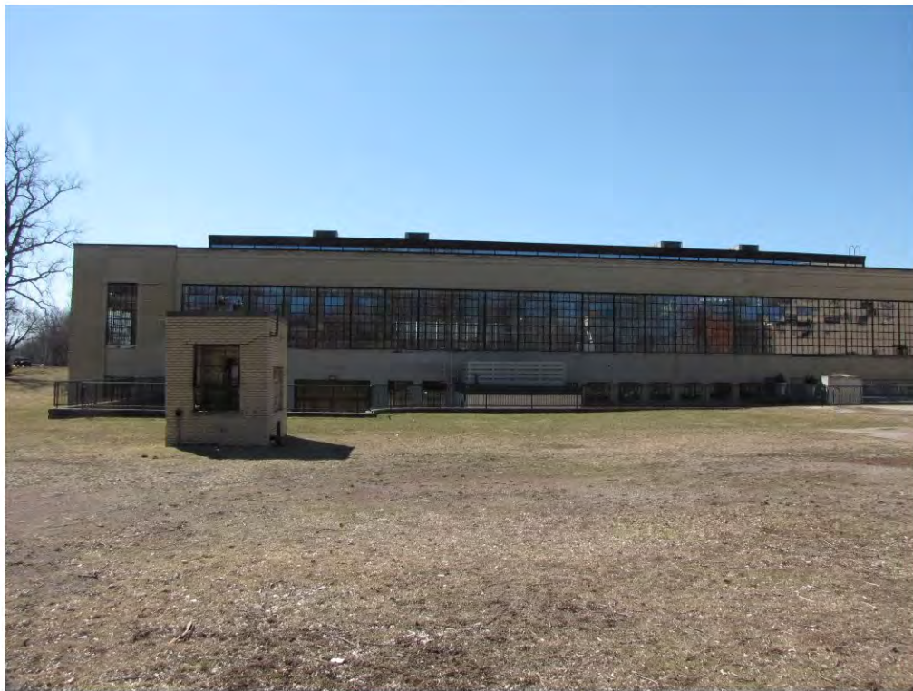
Main East 235_Looking South