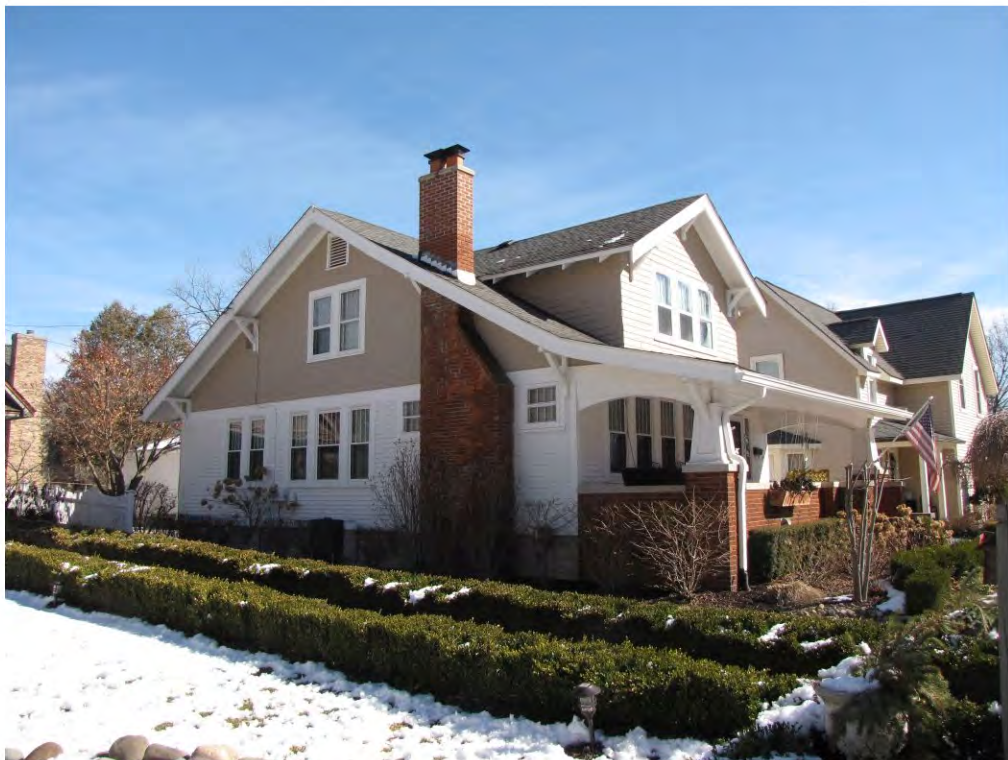
Dubuar 406_Looking Northeast