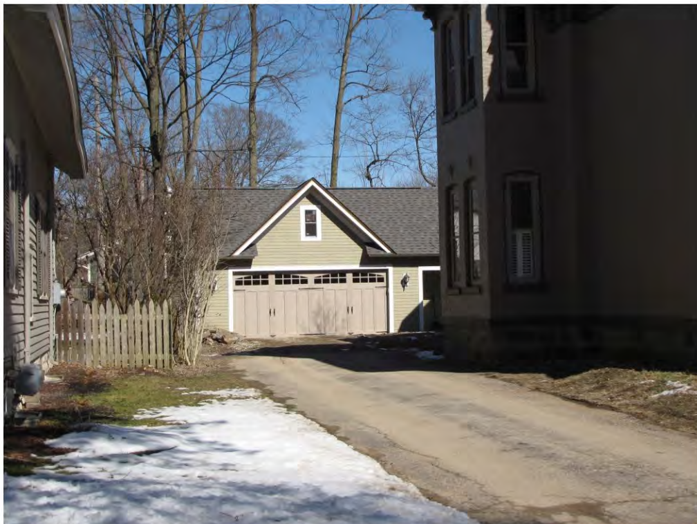
Dunlap West 512, Garage_Looking North