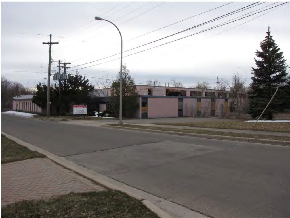
Cady East 456_Looking Southeast