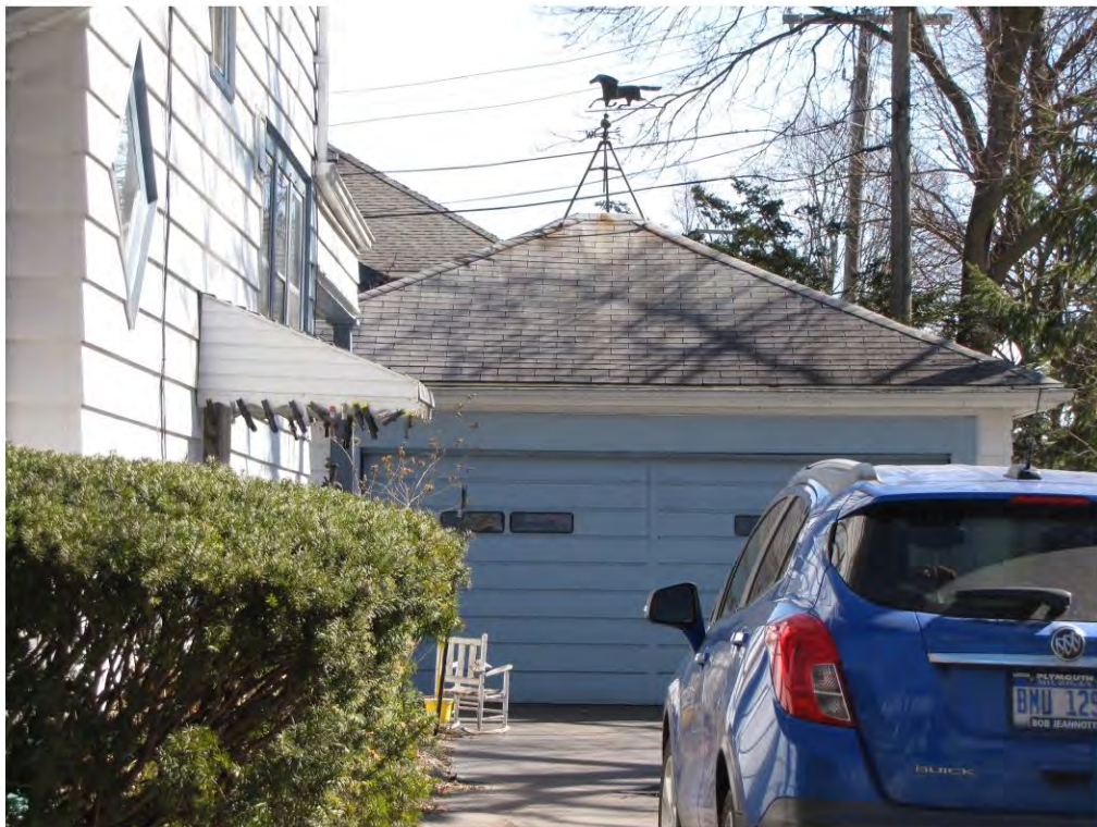
West 114, Garage_Looking East