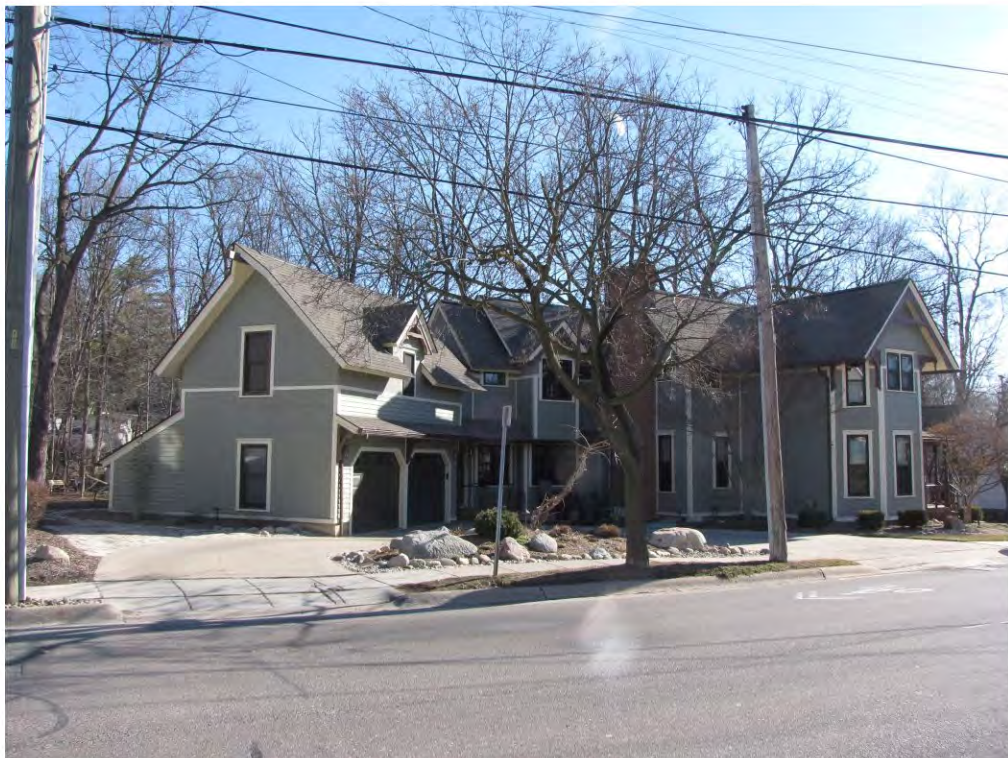
Randolph 402_Looking Northeast