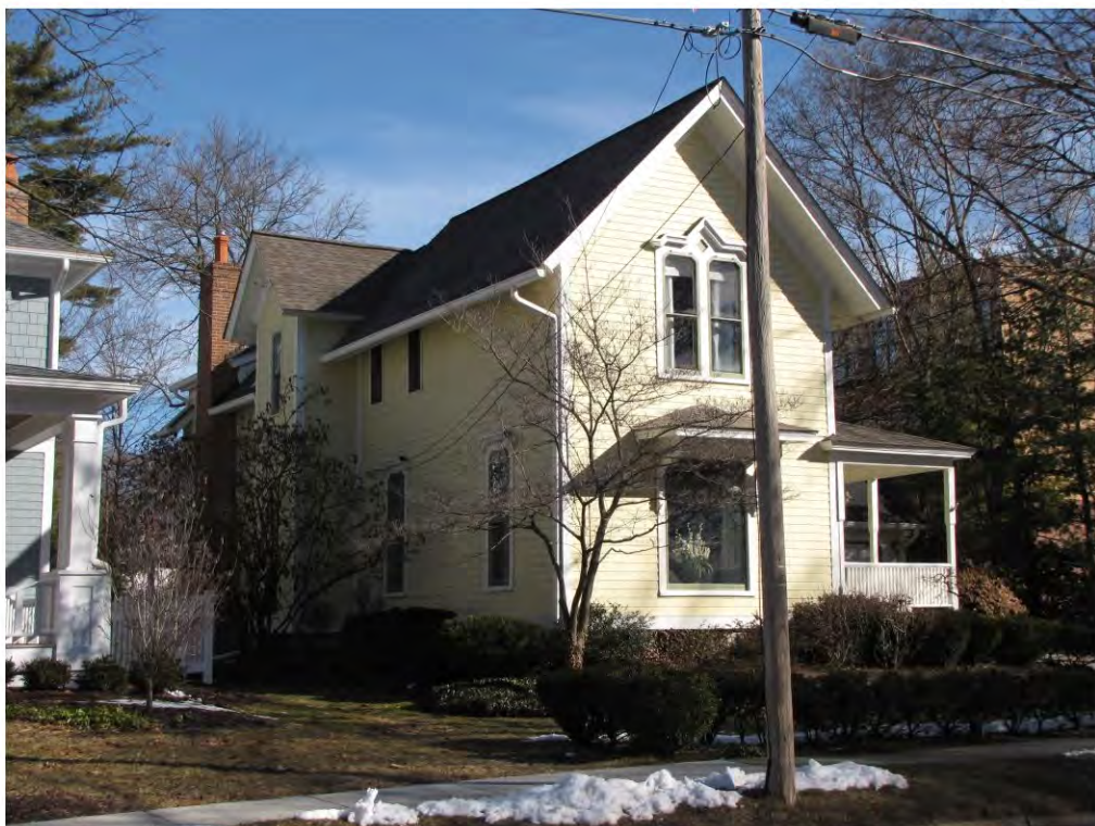
Cady West 494_Looking Northeast