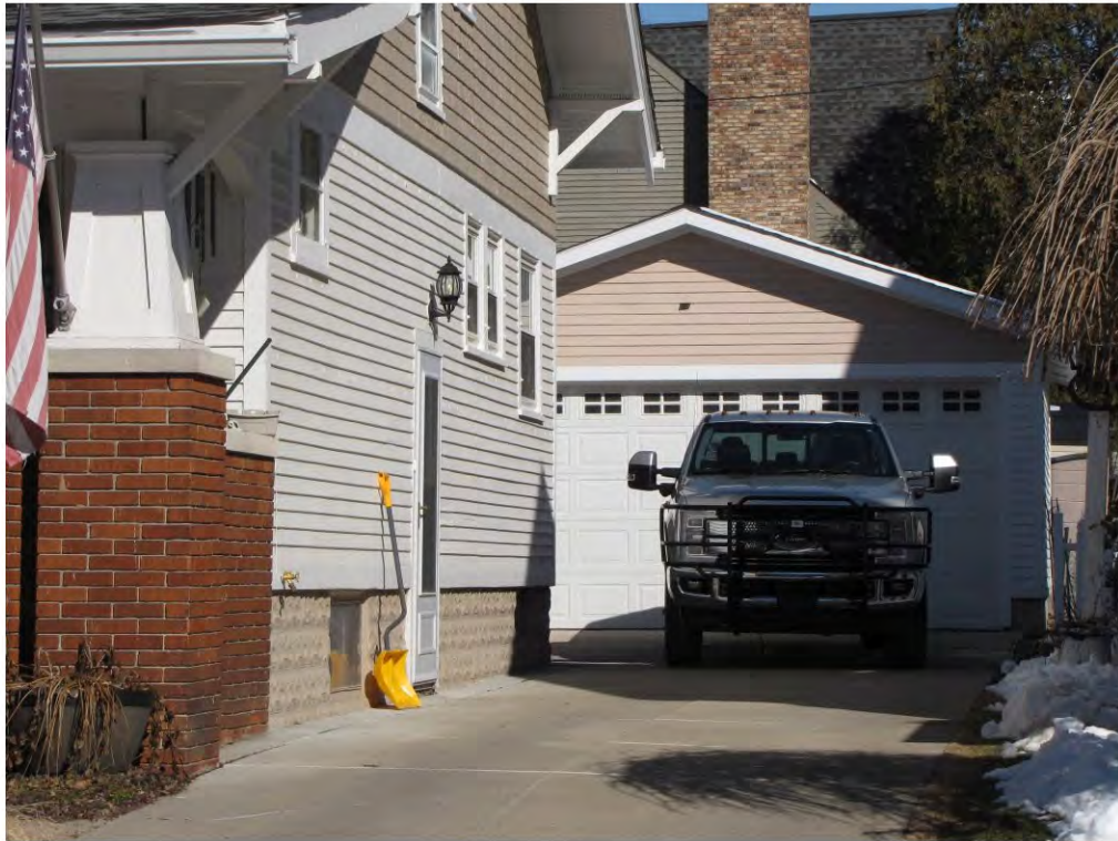
Dubuar 406, Garage_Looking North