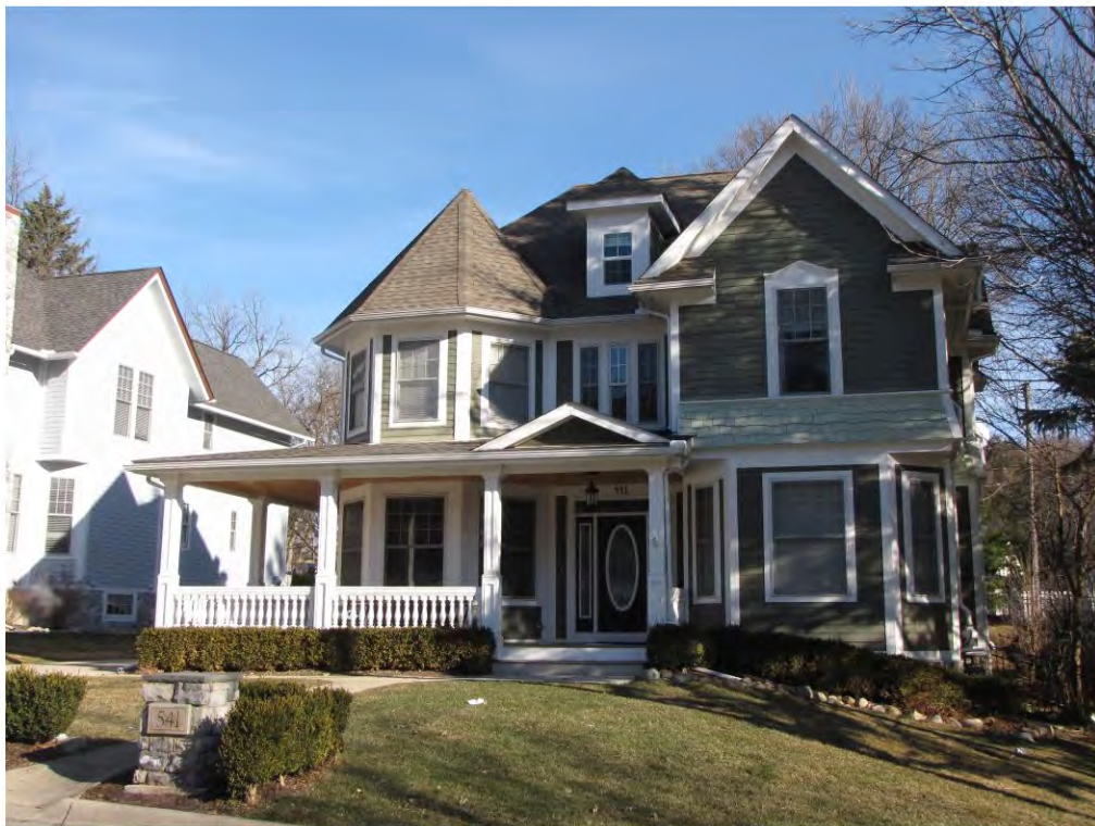
Linden Court 541_Looking North