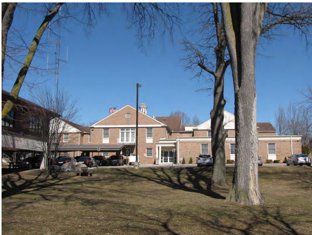
Main West 215_Looking North