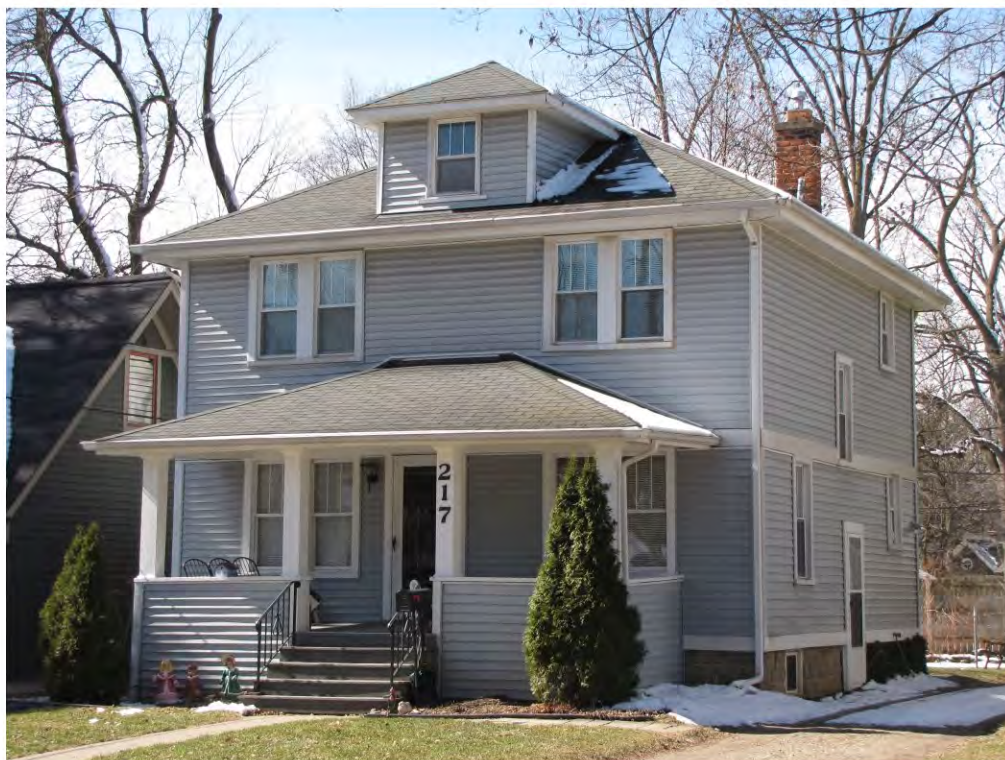
Linden 217_Looking Southwest