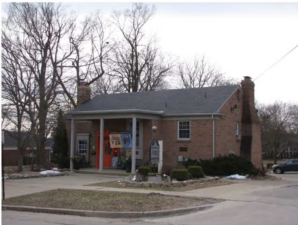
Cady West 215_Looking Southeast