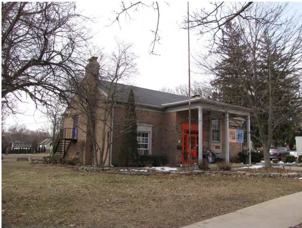
Cady West 215_Looking Southwest