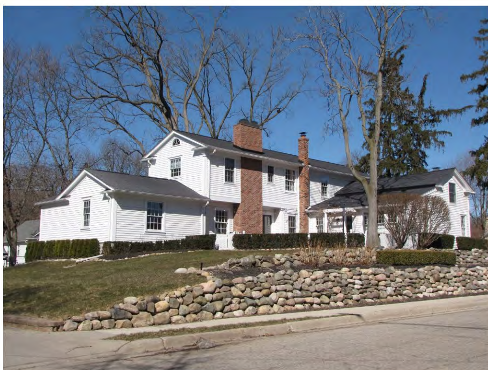
West 247_Looking Northwest