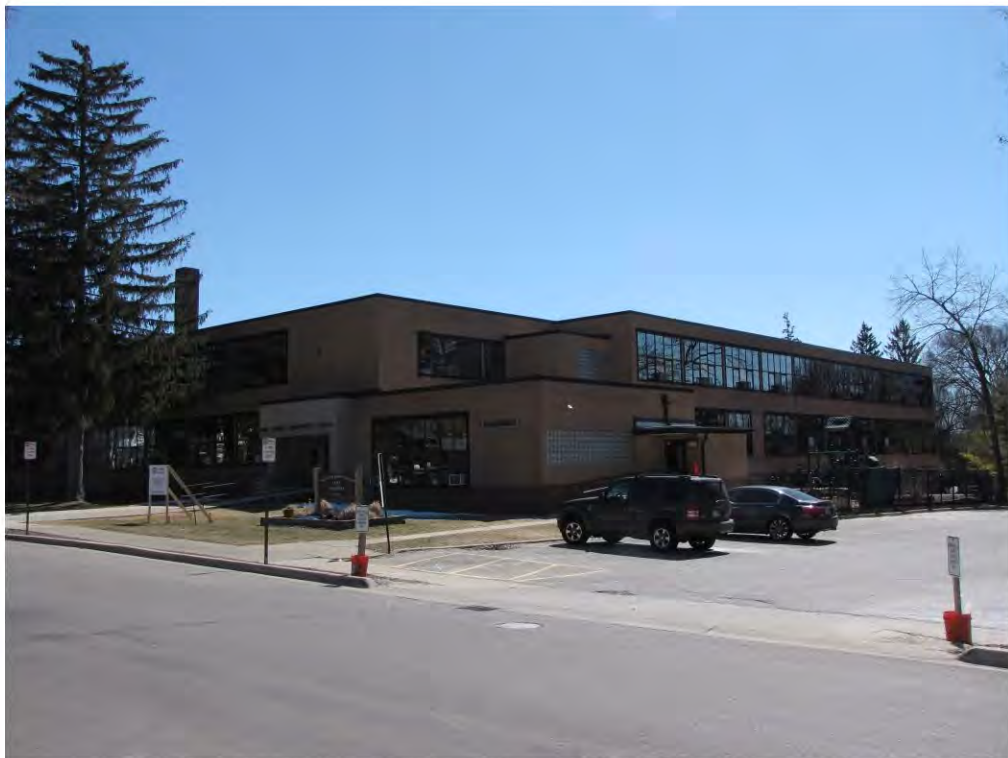
Main West 501_Looking Southeast