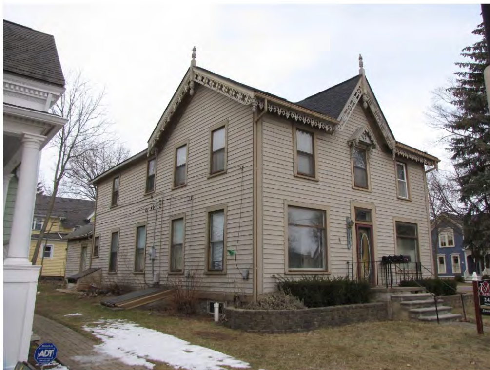
Wing North 129_Looking Northwest