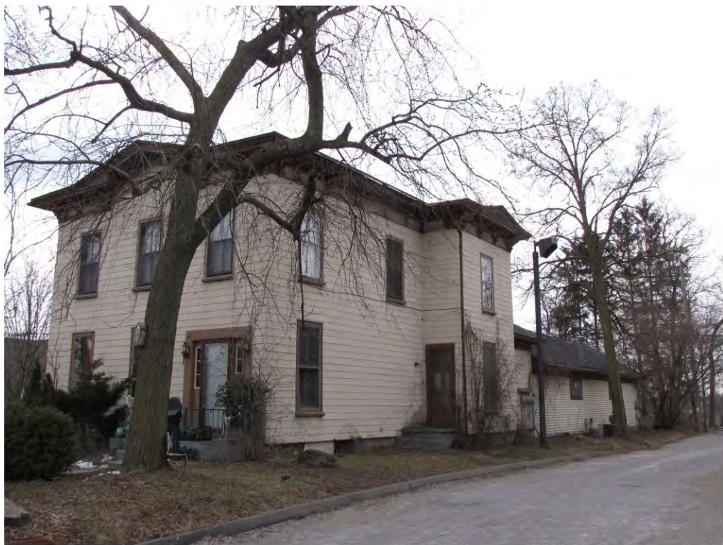
Main East 342_Looking Southeast