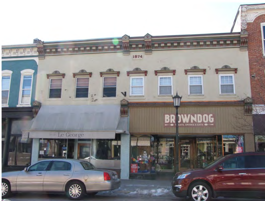
Main East 120-124_Looking South