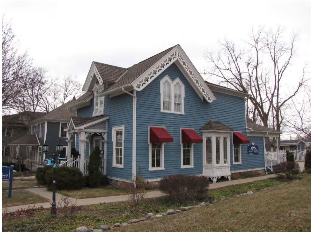
Main East 410_Looking Southeast