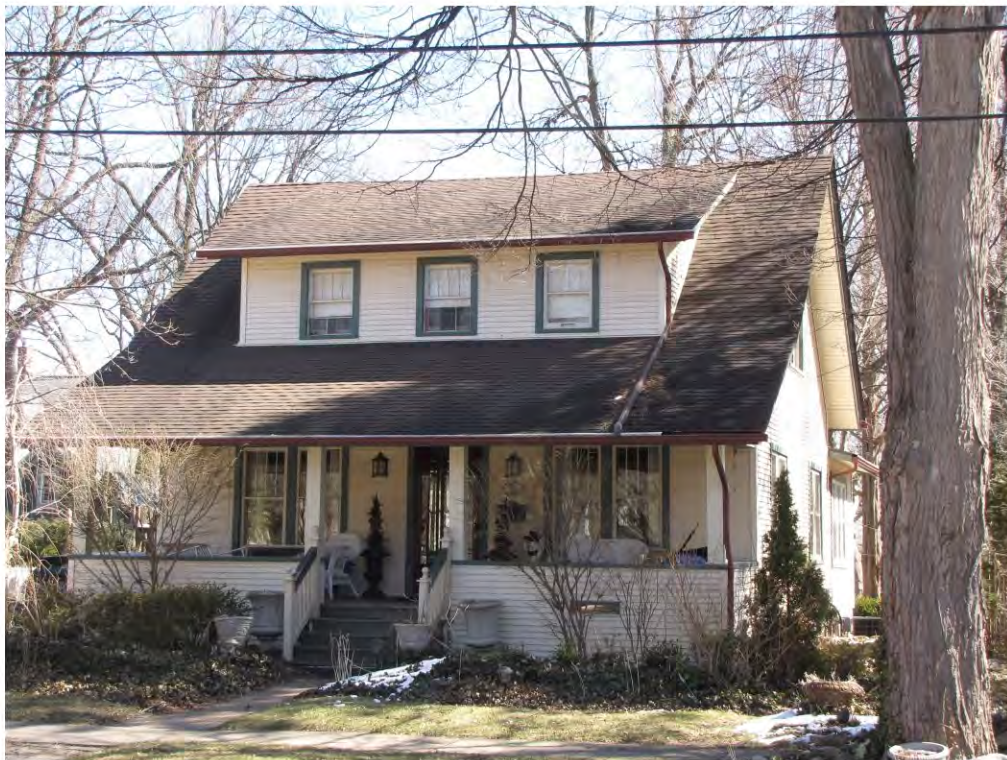
Linden 118_Looking East